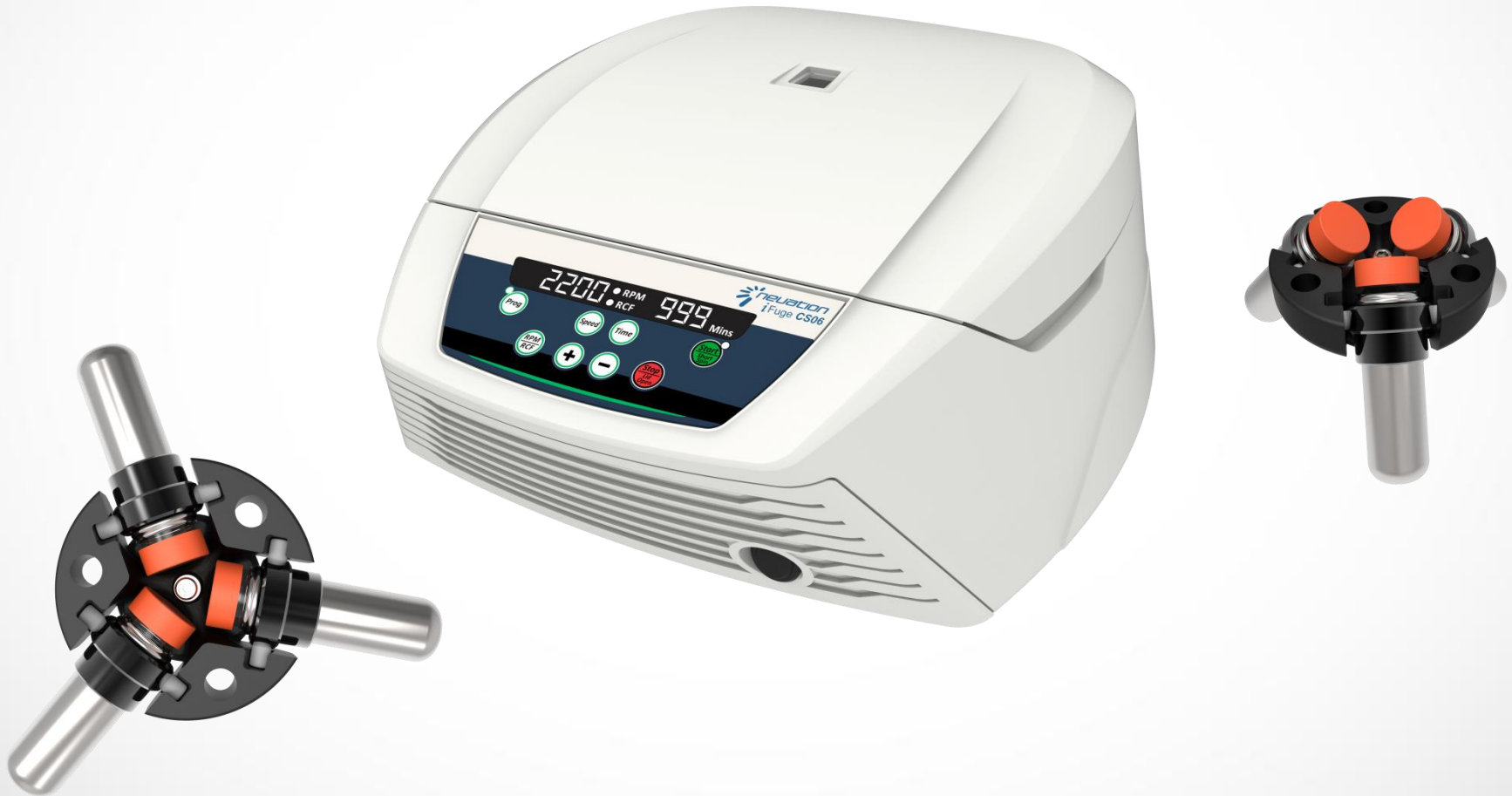
Clinical Swing-Out Centrifuge (iFuge CS03)